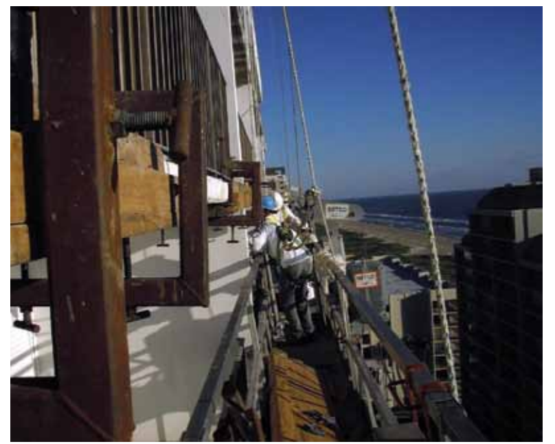
Repair work accomplished using swing stages

Once the deteriorated concrete was removed, the contractor treated or replaced any damaged reinforcing steel. Most of the balcony edge steel that was situated in the post-tensioned anchor zone needed to be replaced. Special custom-made forms and clamps were used to reduce the time required to erect shoring for each balcony.