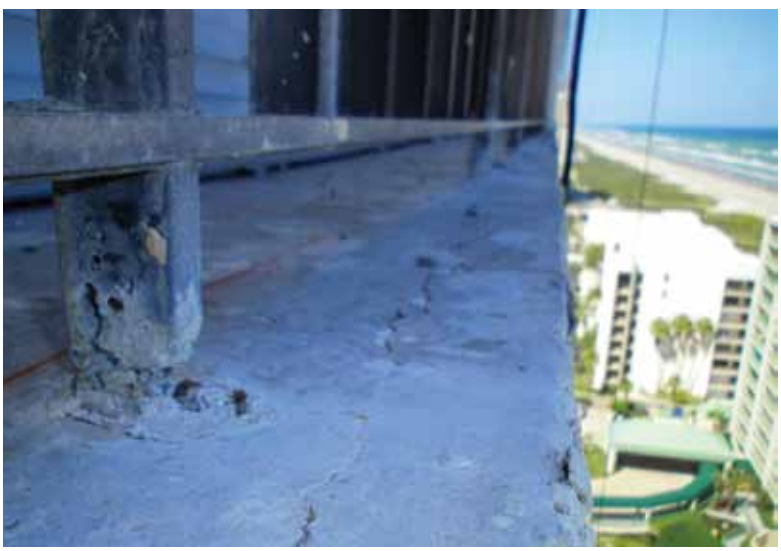
Deteriorated balcony slabs