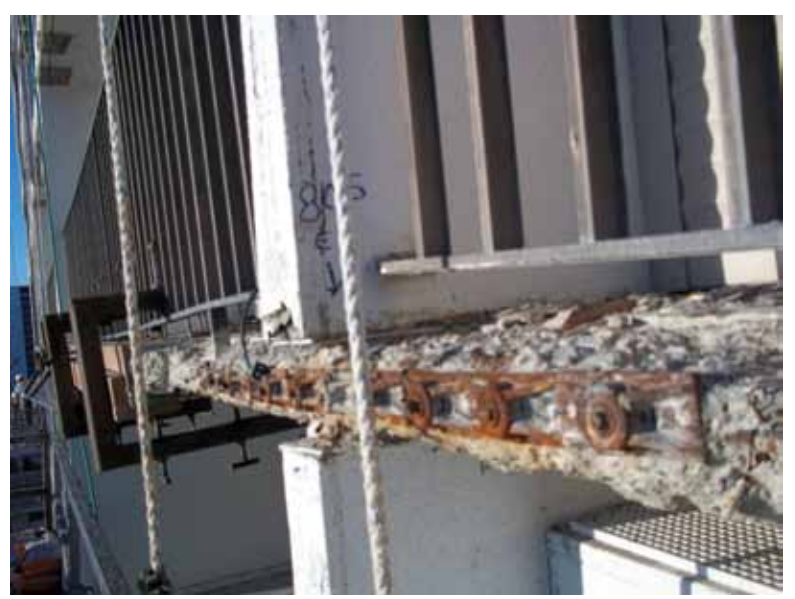
Corroded post-tensioned anchors

Work was conducted from 40 ft (12 m) swing stages. Because of the proximity to the Gulf,