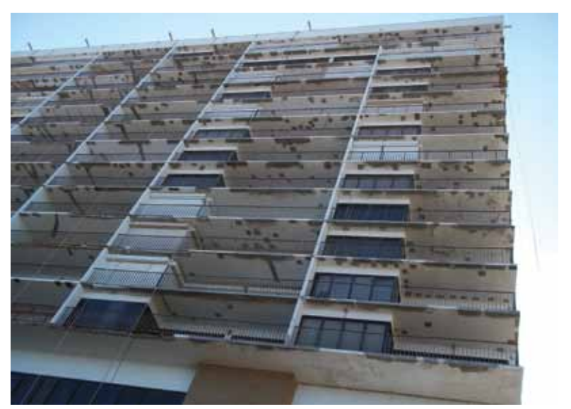
An extensive amount of concrete repairs were required for the balcony edges and soffits